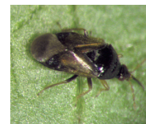
Minute Pirate bug