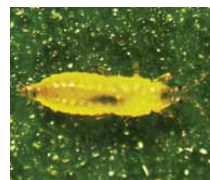
Larval Western flower thrip

NOTE: If poor WFT control is encountered after an insecticide application, DO NOT simply apply the same product again at a higher rate or shorter spray interval and hope for better control. Determine if poor control resulted from application error, equipment failure or unfavorable environmental conditions during or after application. If none of these occurred, contact your local agricultural adviser and the product manufacturer so they can determine if the WFT population is becoming resistant.