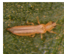
Adult Western flower thrip

Natural enemies, such as minute pirate bugs ( Orius spp.), lacewings and predatory mites ( Amblyseius spp.), can provide significant control of WFT populations.