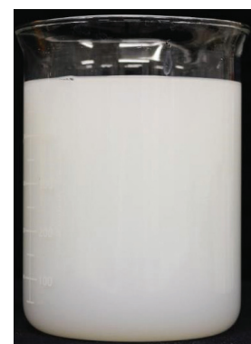
Figure 3: Emulsion of Pixxaro EC in water after gentle agitation

Pixxaro EC (figure 1) rapidly forms emulsion when added to water without agitation (figure 2). Mild agitation is required to form a stable and uniform emulsion (figure 3). Unused Pixxaro EC should be stored in its original package with the cap tightly closed. Pixxaro EC should remain free-flowing in the package during storage.