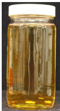
Figure 1. Pixxaro EC