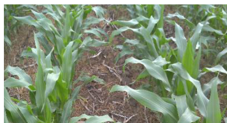
Kyro 45 fl oz/A + Durango DMA 1 qt/A + atrazine 1 qt/A + NIS 0.25% v/v 14 days after application (Iowa)