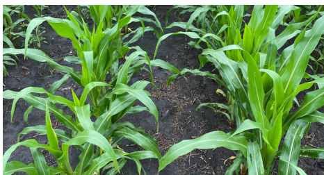
Kyro at 35 fl oz/A + Durango® DMA® herbicide 1 qt/A + atrazine 1qt/A + NIS 0.25% v/v 22 days after application (Missouri)