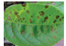
Cercospora Leaf Spot