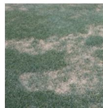
Spring Dead Spot