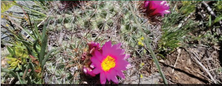
Cactus Forb