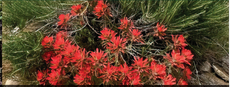
Northwestern Indian Paintbrush Forb